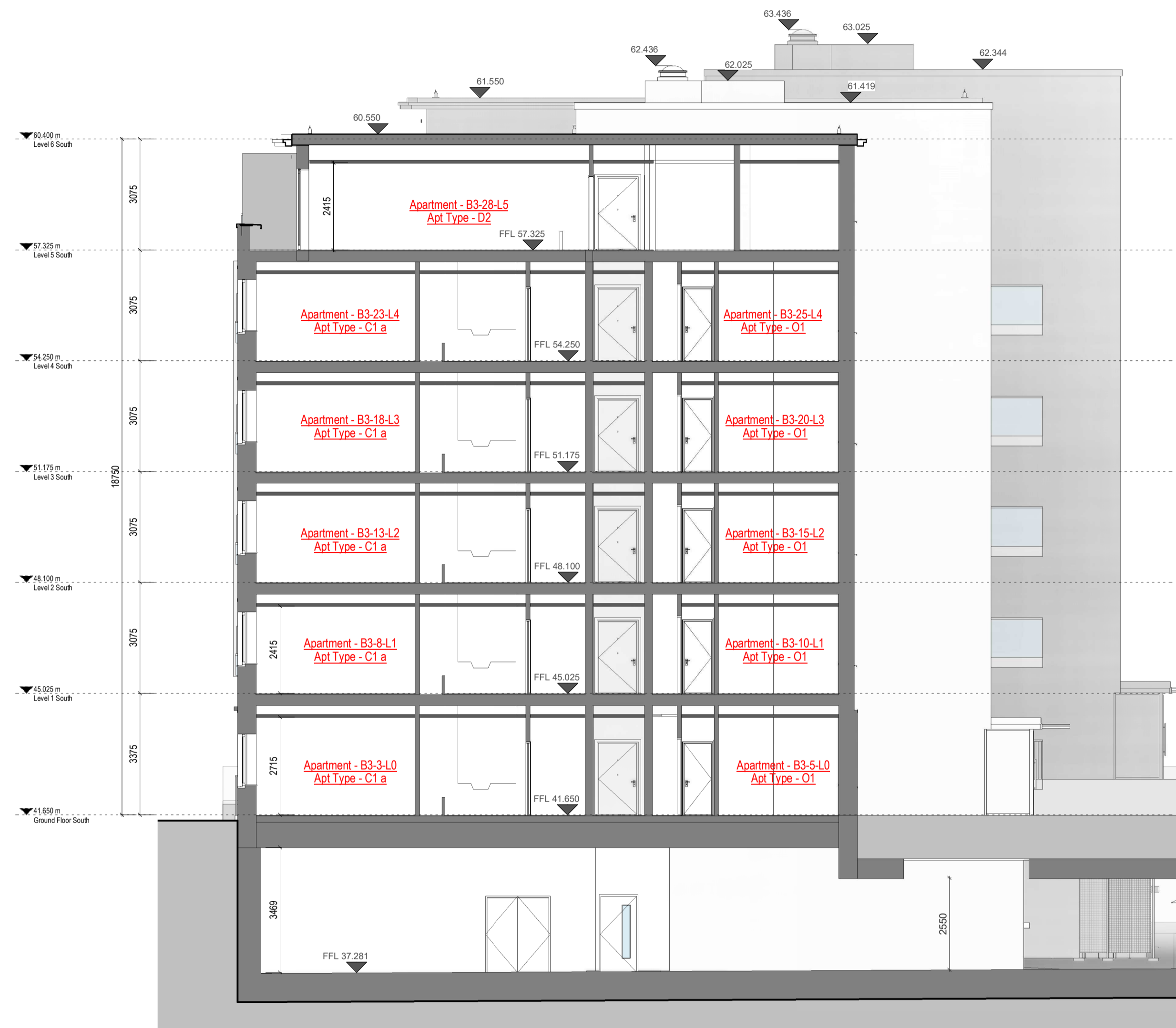
1 GA - Section BB